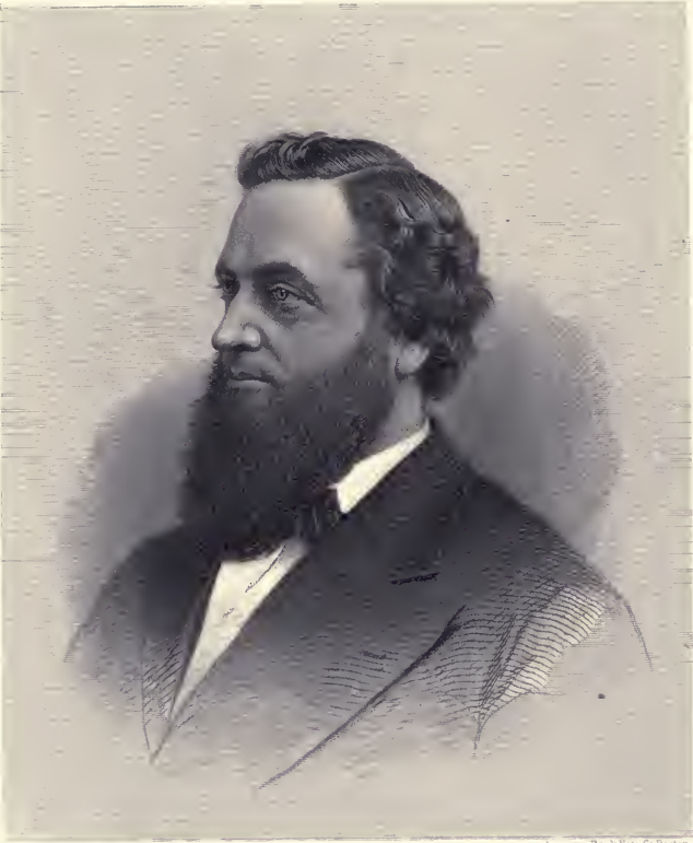
American Bank Note Co Boston