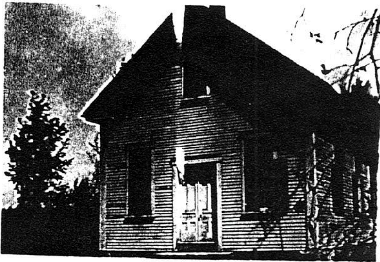
Former G. L. M. P. T. A.