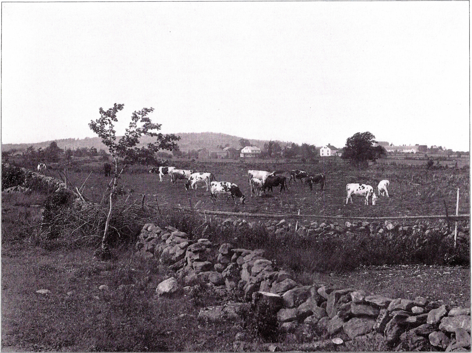
T HE Wilson Farm in Gilmanton. Seen at a distance in this picture are some of the fields and houses associated with one of the largest farms in New Hampshire. Under the direct management of a man of mature judgment and extensive Western experience, who has come to believe most thoroughly in New England agriculture and the possibilities of farming in his native town, here are twelve hundred acres devoted to grass and potato raising in connection with the maintenance of a milk-producing dairy herd. Under a plan of management which might be classed as both intensive and extensive, even the pastures of this farm are recipients of fertilizer systematically applied.