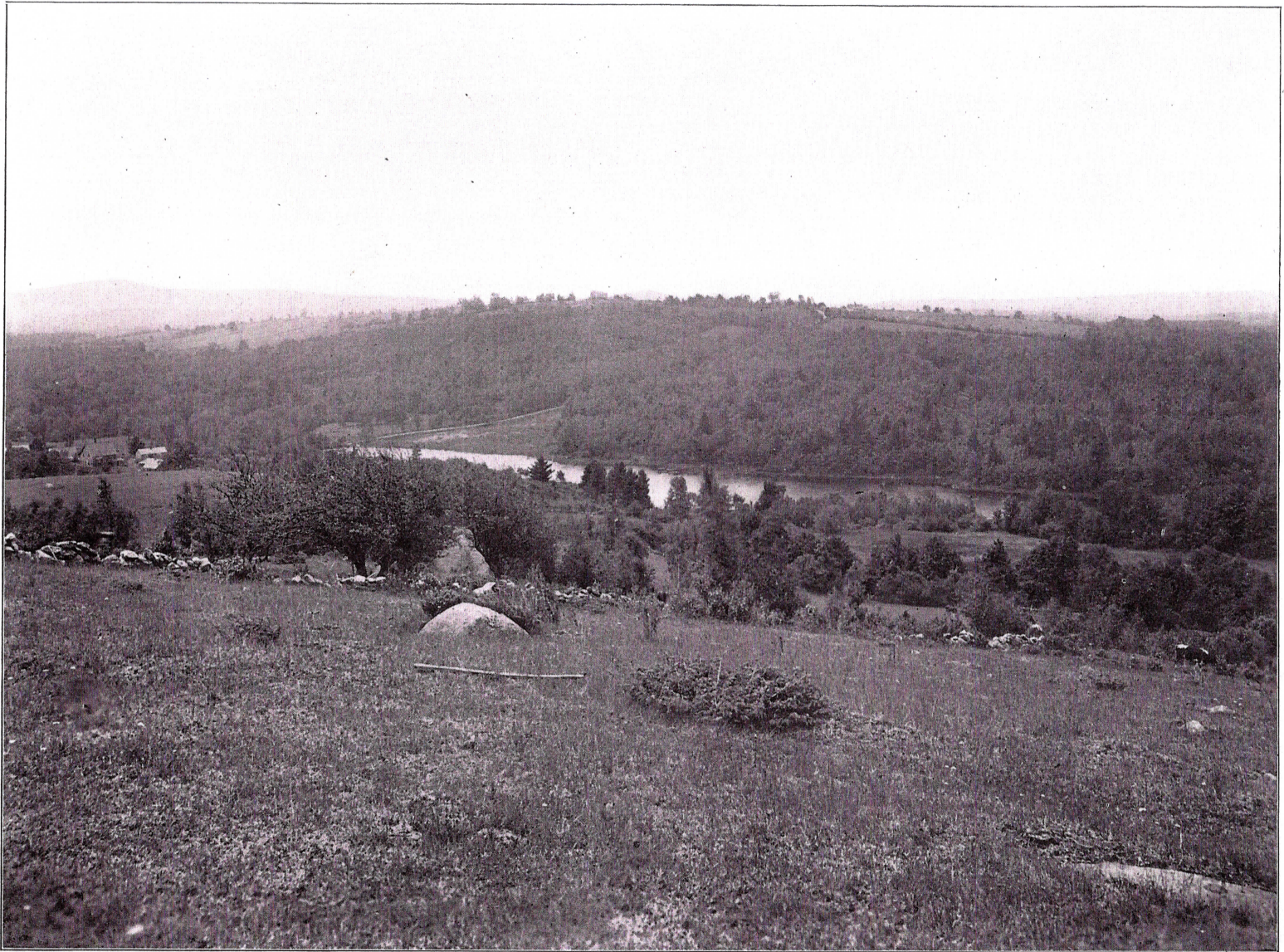
A PASTORAL scene in Gilman showing a hill farm, comprising many acres of fertile land, which is carried on in a thoroughly modern and scientific way. Gilman was one of the earlier settled towns of the state and its history is replete with the strong characters of men and women who lived and toiled to establish homes that should reflect, in the days to come, the strength and stability of a virile people.