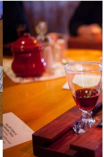
A group of friends try a flight of wine samples at the Gilmanton Winery and Vineyard on April 28.