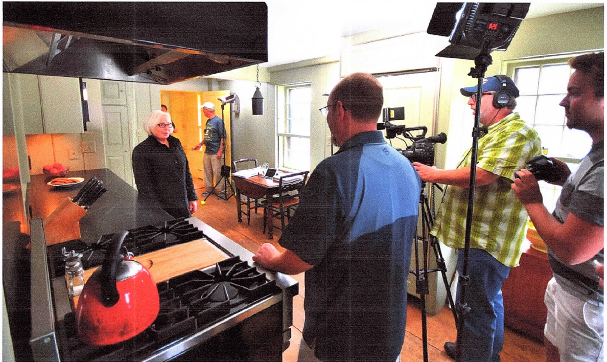
HGTV crews record a scene in the historic Gilman home, which is expected to air sometime in March.