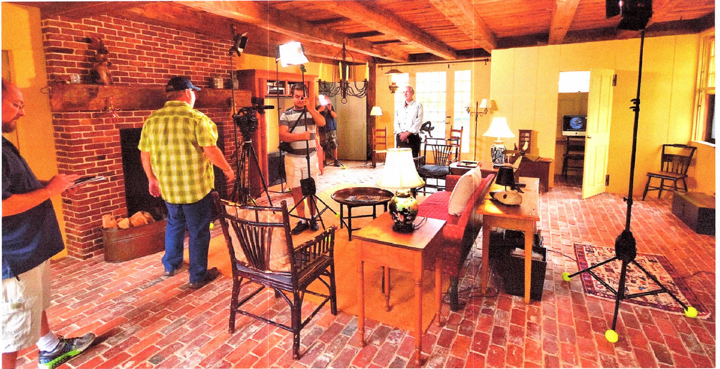
The "old corner store" home in Gilmanon Corners will be featured on HGTV's "You Live in What?"