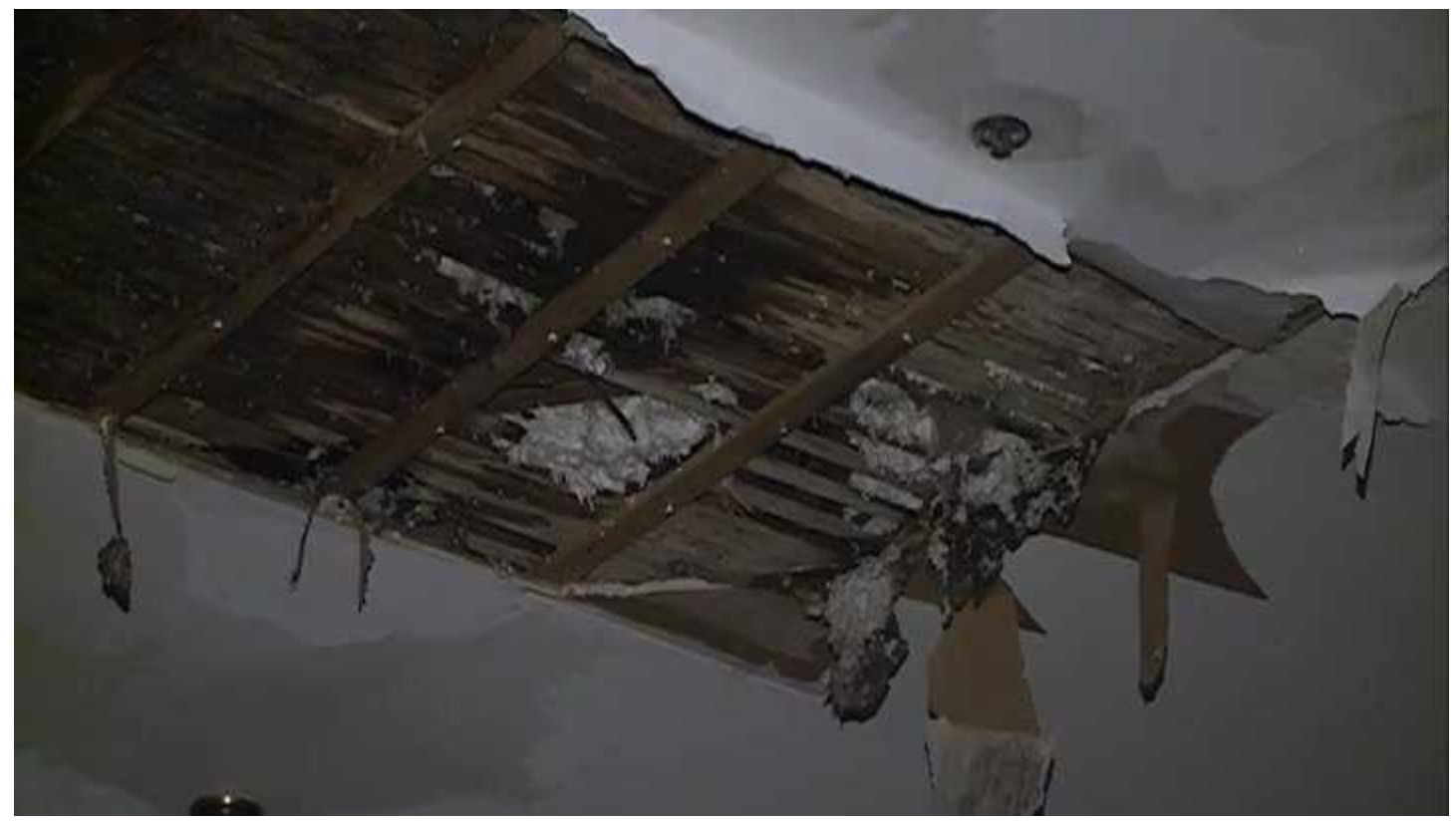
GILMANTON, N.H. —

The Gilmanton town offices have been temporarily relocated after a sprinkler pipe burst, causing serious water damage.