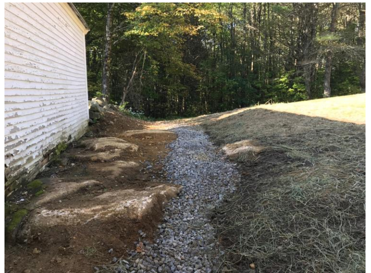
Electrical line trench