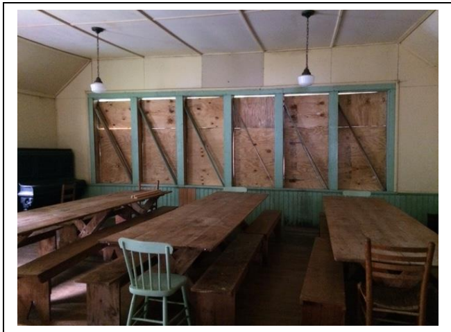
Many clapboards were in need of replacement South wall windows prepped for restoration Privy lifted for structural repairs.