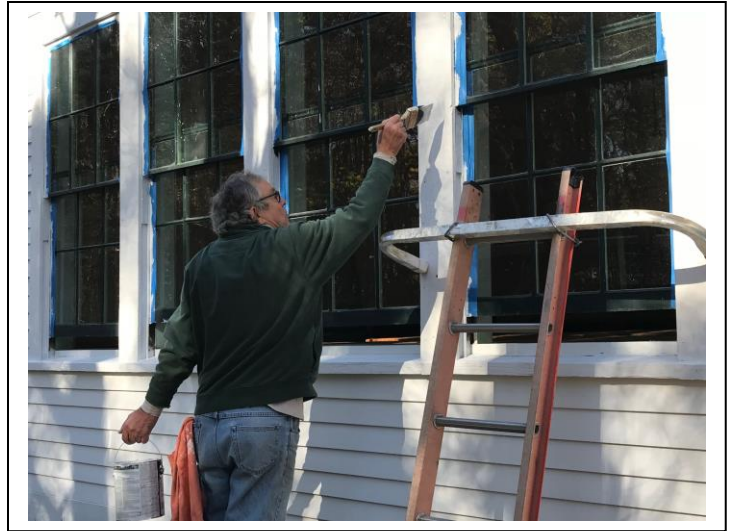
Phase 1 Completed!